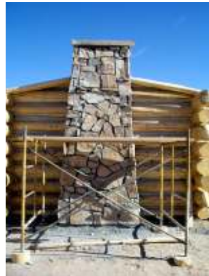
Redd fireplace under construction

As you can see our vision is becoming a reality. Some of you may think that in today's uncertain times it would be impossible to gather the funds, set aside the time, and coordinate family vacations to allow for the construction of such a project but it is in your blood. Those who settled Bluff Fort "accomplished the seemingly impossible through dedication, cooperation, and industry" and with their spirit of faith and determination you can accomplish this as well.