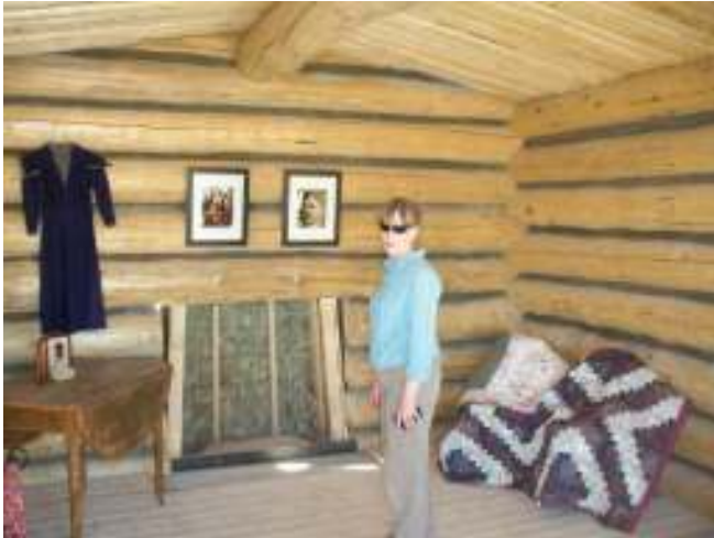
Inside the newly constructed Redd Cabin

children and adults alike will always remember their chance to LIVE a little of the past, to understand how important dedication, commitment, and hard work was to their ancestors. They now can say they have experienced the stickytoitee that was so much a part of the pioneer way of life in Bluff. We invite you to become part of this life changing experience by gathering together as descendants of _____ and reconstructing their cabin.