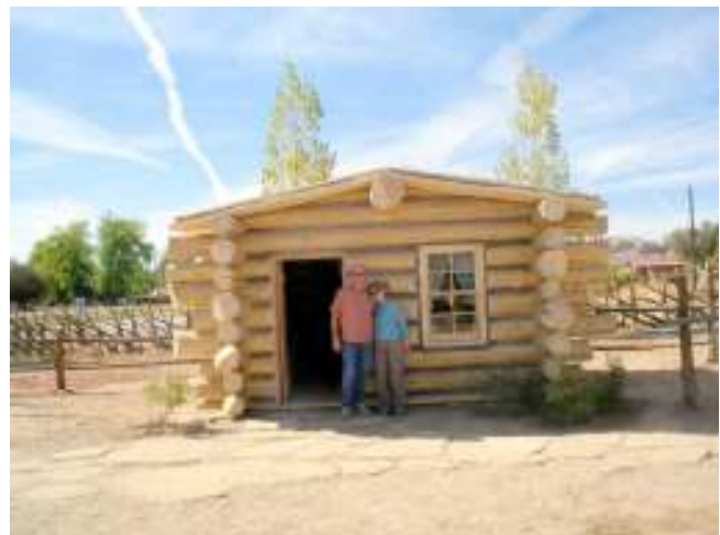
The Reality -- the Redd Cabin

We had the wonderful opportunity to have over 100 family members and friends of James Monroe visit Bluff in October and participate in the construction of our first three cabins. They included the Redd cabin, the Barton cabin and the Amasa Barton blacksmith shop.