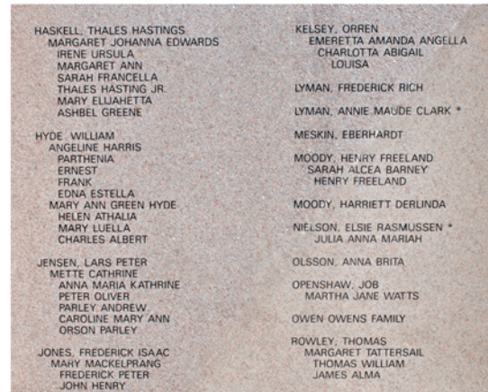
The new monument commemorates those called to the San Juan after the arrival of the initial settlers.